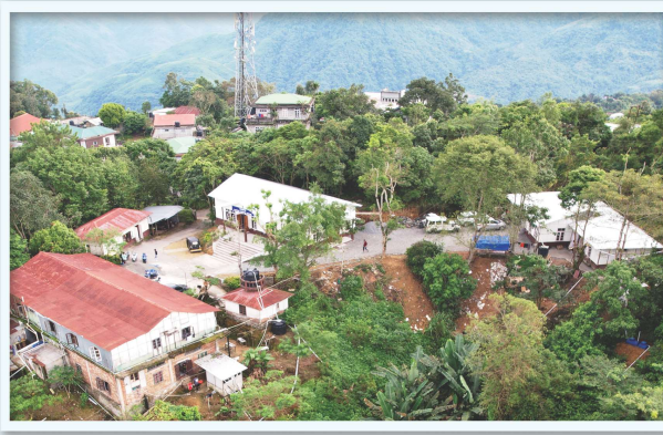
BAPTIST CAMPING CENTRE, SERKAWN